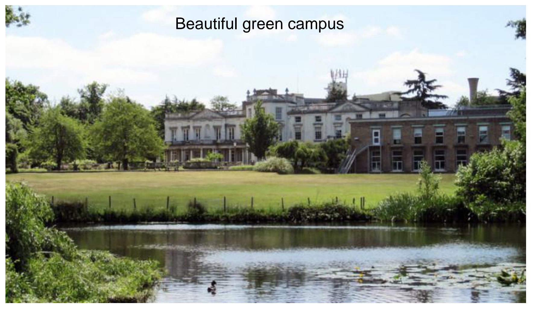
Great potential for a food growing project