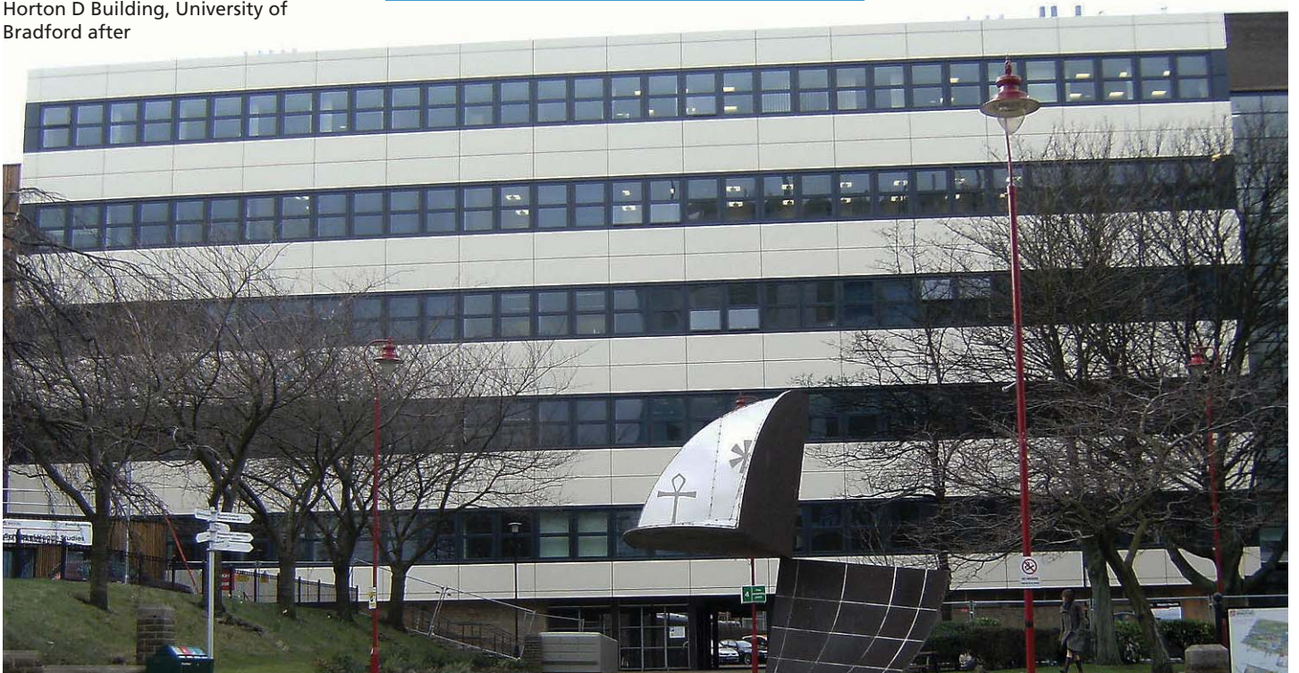
Horton D Building, University of Bradford after

The project comprised design and build of an insulated aluminium rainscreen and window replacement. Additional works undertaken included new curtain walling and refurbishment of the existing main entrance lobby renewing wall, floor and ceiling finishes and demolition/removal of the existing roof plant.