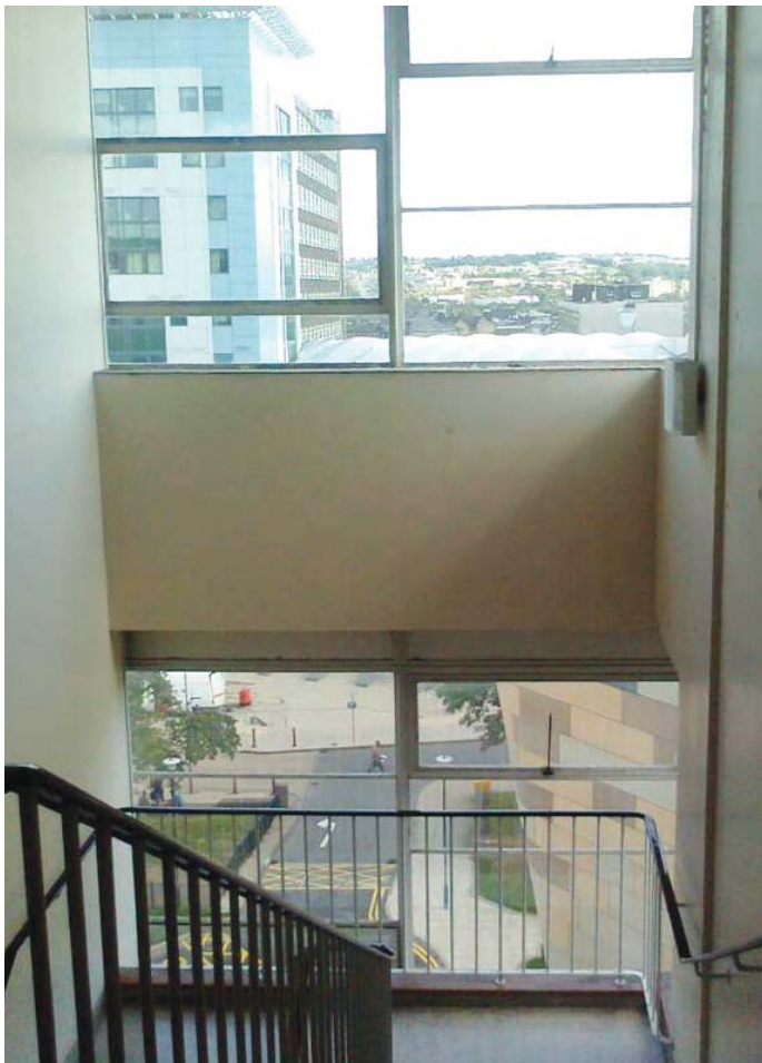
Horton D Building, University of Bradford before