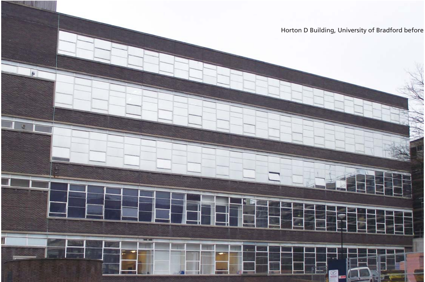
Horton D Building, University of Bradford before