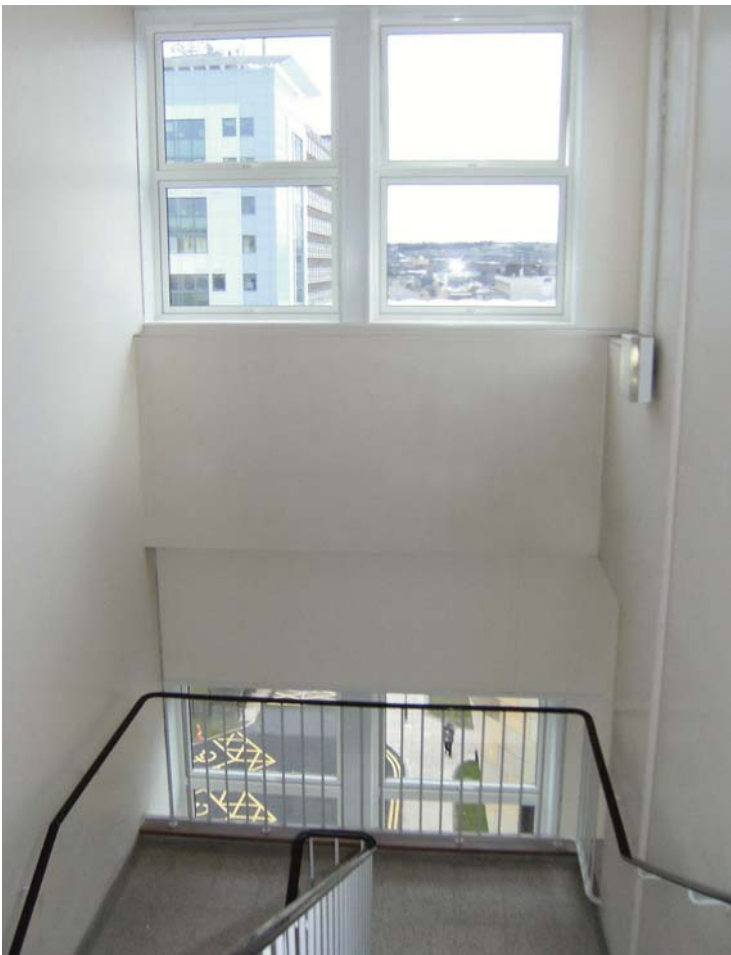
Horton D Building, University of Bradford after