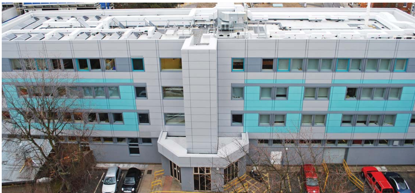
Bedford College, Workshop Building after