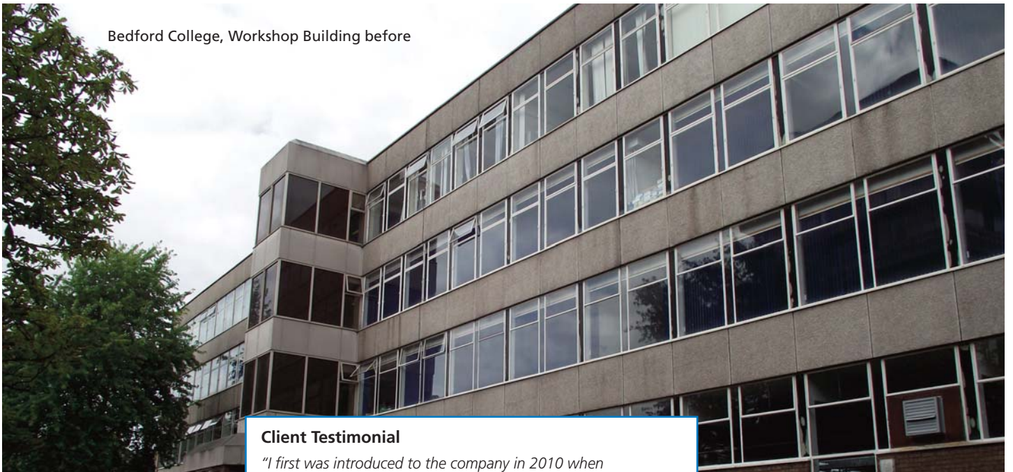
Bedford College, Workshop Building before