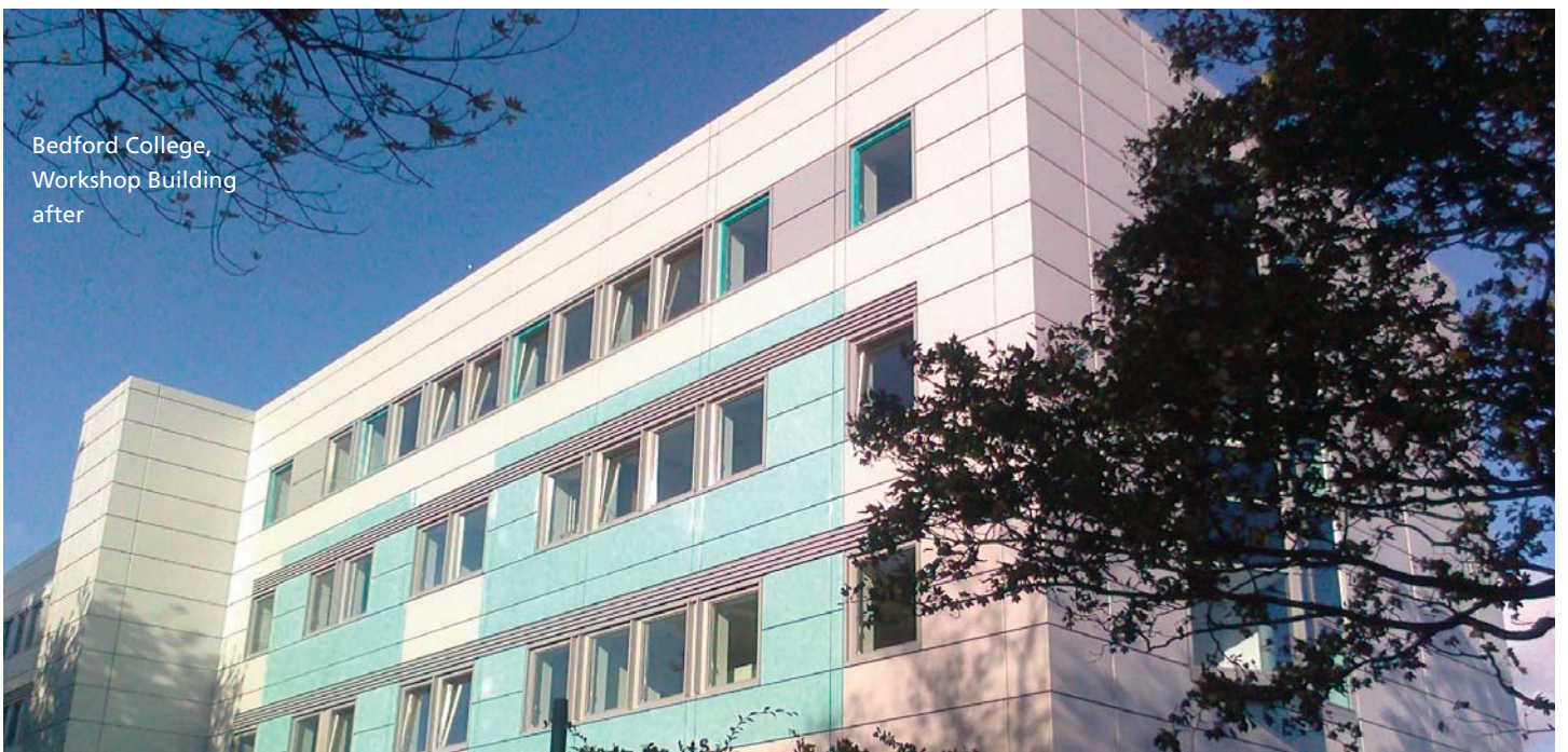
Bedford College, Workshop Building after

The project comprised design and build of an insulated aluminium rainscreen, window replacement and insulated roofing to the four storey Workshop Building. Additional works undertaken included replacement of ground floor screens, screens and doors to the new entrance and display plant room, glazing to a new roof access pavilion, formation of an external vertical service riser to the roof and installation of new feature glazing and display panel within the cladding to the north elevation.