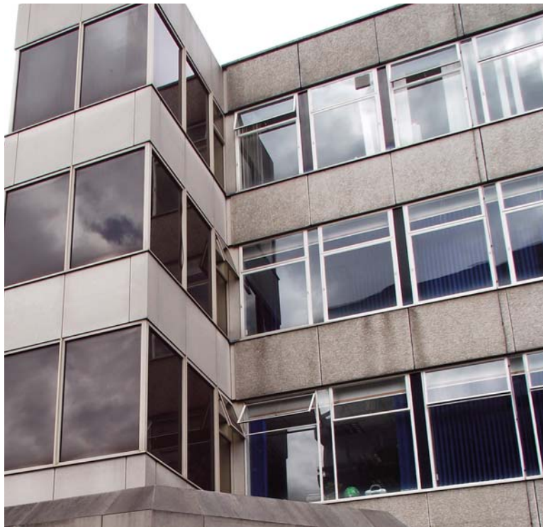
Bedford College, Workshop Building before