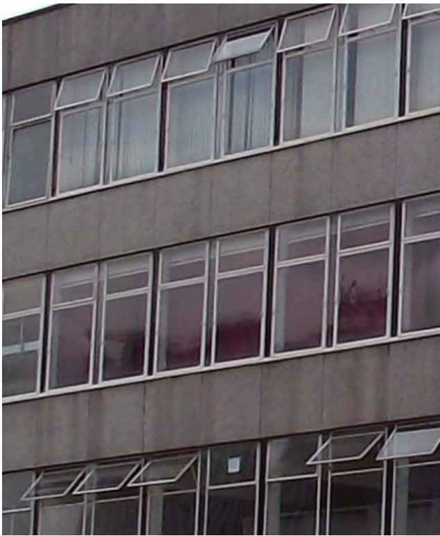
Bedford College, Workshop Building before