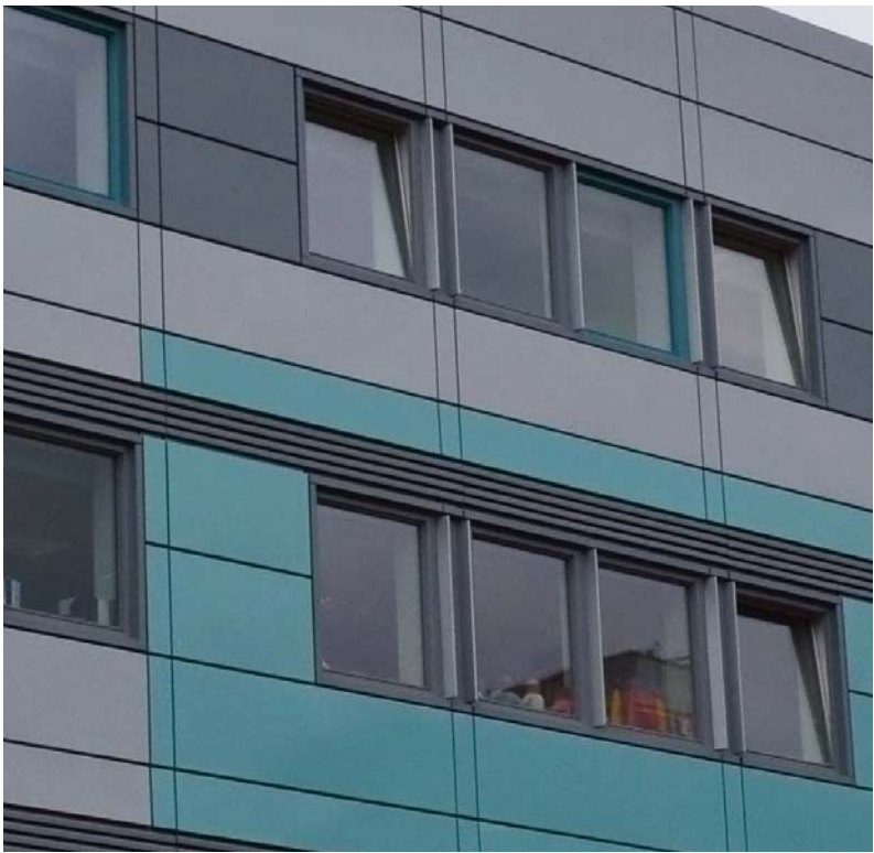
Bedford College, Workshop Building after