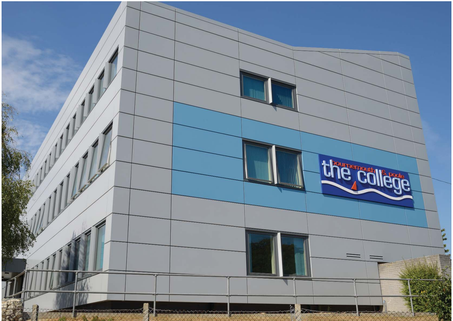
The Bournemouth & Poole College, North Road Campus