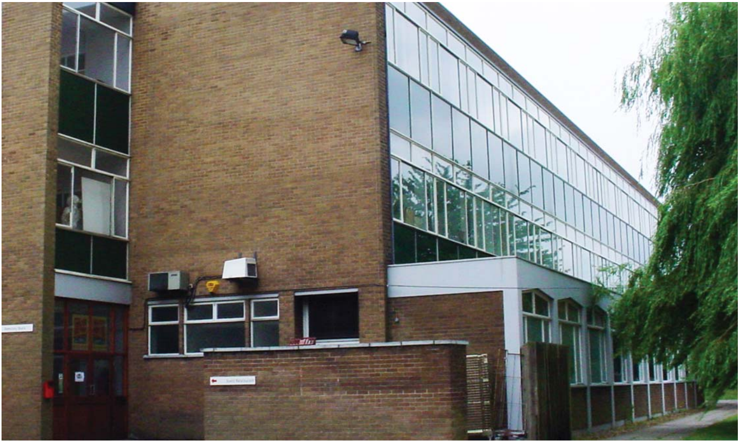
College of West Anglia before