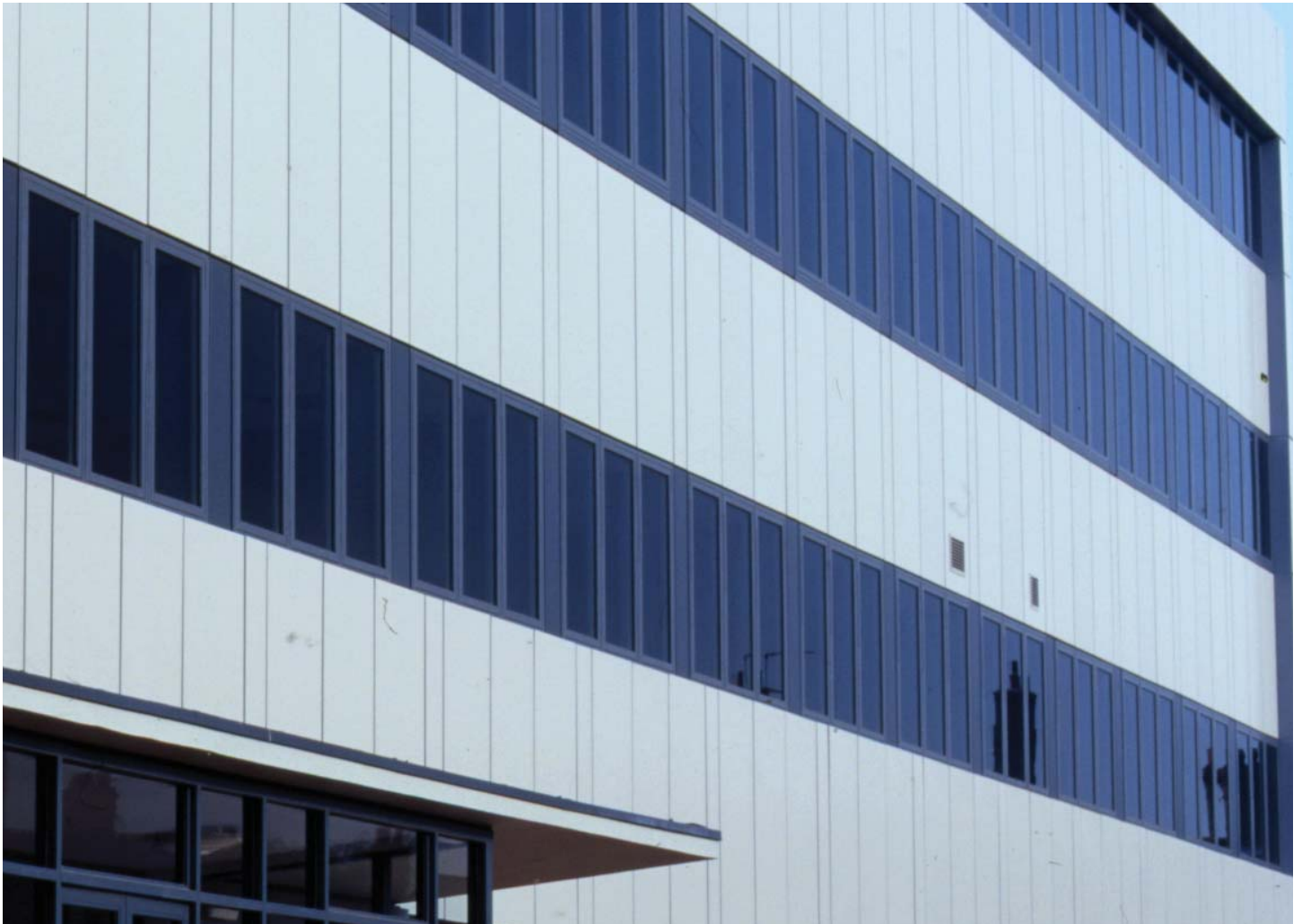
College of West Anglia after