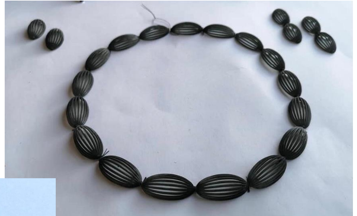
Plant Based Resin