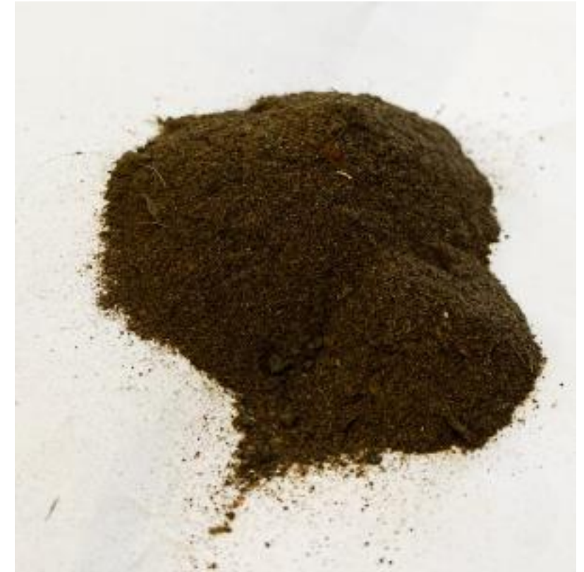
Dust collected from the M8