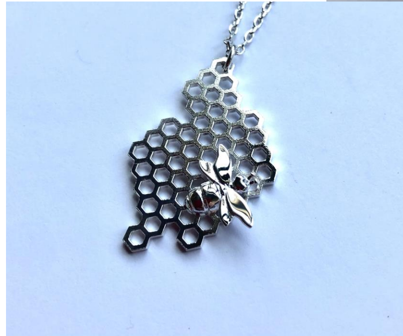
Silver reclaimed from discarded NHS Xrays