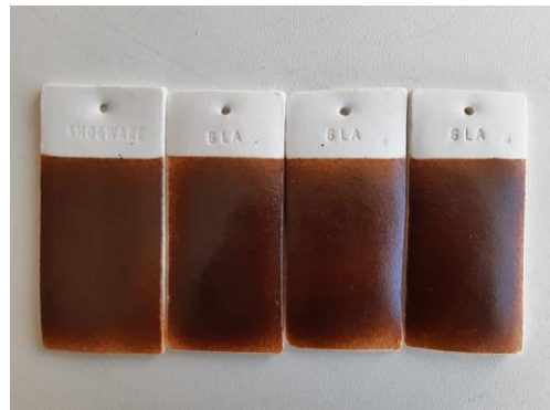
Examples of workshops - from dust to design in City of Glasgow College.