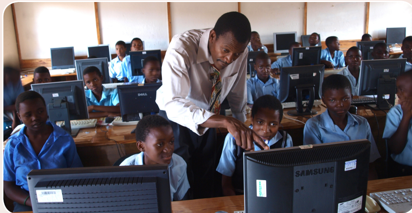
Computer lab in Malawi installed by ITSA

We gratefully acknowledge the support of Commercial Group in the production of this brochure.