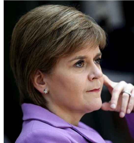
Scotland's First Minister July 2015

And that is why I am delighted to confirm that Scotland has become one of the very first countries to publicly sign up to these goals ...'