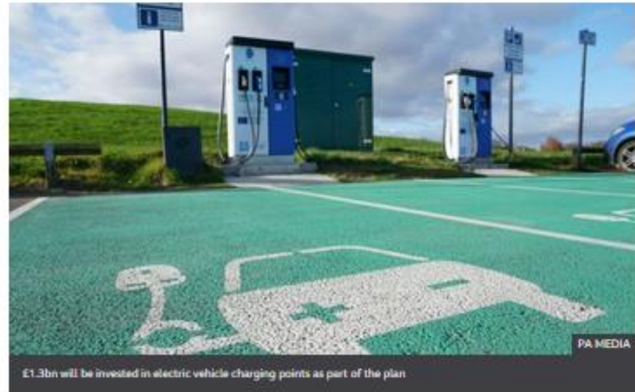
£1.3bn will be invested in electric vehicle charging points as part of the plan

New cars and vans powered wholly by petrol and diesel will not be sold in the UK from 2030, Prime Minister Boris Johnson has said.